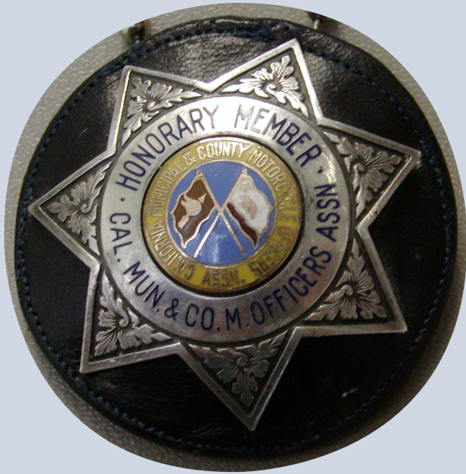
HONORARY MEMBER BADGE MUNICIPAL MOTORCYCLE OFFICERS OF CALIFORNIA