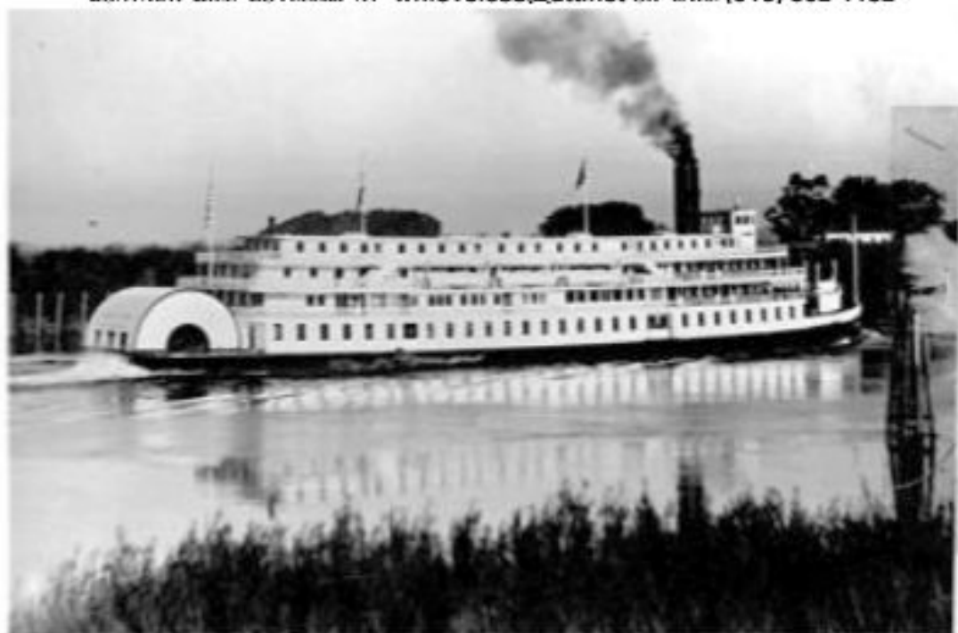
The Delta King 1938