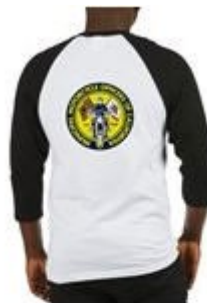
MORE COLORS AVAILABLE Mmoc Baseball Jersey $21.59