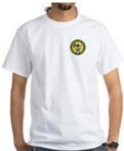
Mmoc White T-Shirt $19.19