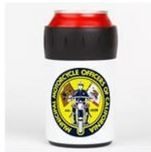
Mmoc Logo Can Insulator $15.59