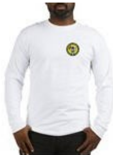
MORE COLORS AVAILABLE Mmoc Long Sleeve T-Shirt $23.99