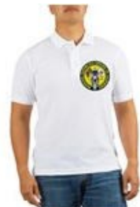
Mmoc Golf Shirt $22.79